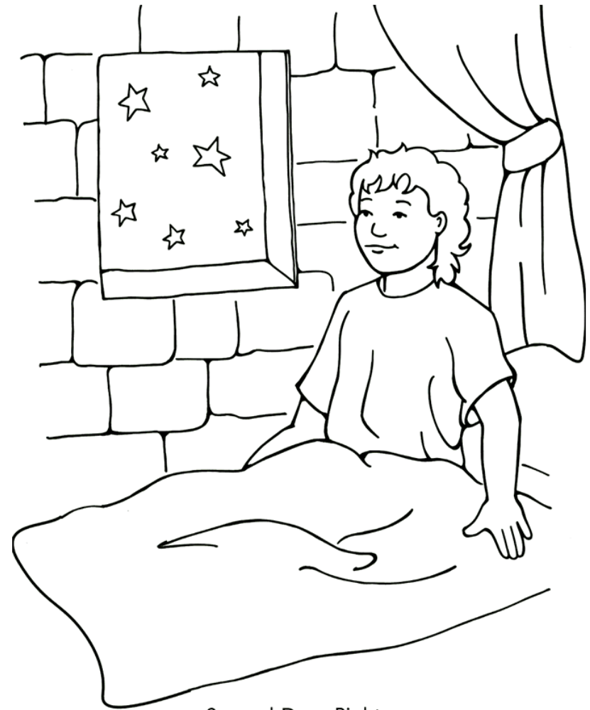
Samuel Does Right 1 Samuel 2-4, 7

From Thru-the-Bible Coloring Pages for Ages 4-8. © 1986, 1988 Standard Publishing. Used by permission. Reproducible Coloring Books may be purchased from Standard Publishing, www.standardpub.com, 1-800-543-1301.