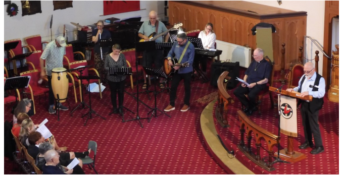
The musical group drawn from Brown Hill and BCUC.