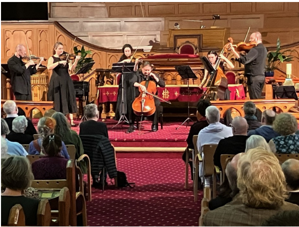
Chamber Philharmonic Colonge on their annual visit to BCUC played to an audience of 225 patrons.