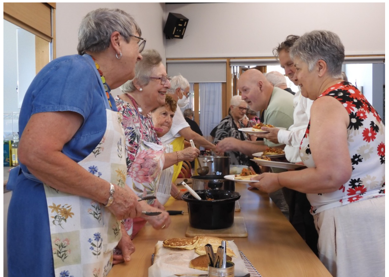
Eager diners line up for a pancake lunch that raised $922 for Uniting Bal-larat.