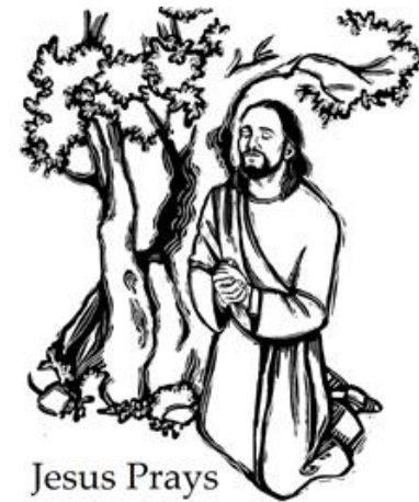
Jesus Prays for his disciples.