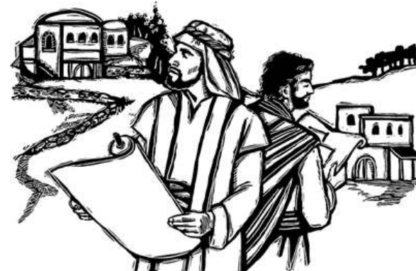
The Wise and Foolish Builders Matthew 7:24-27